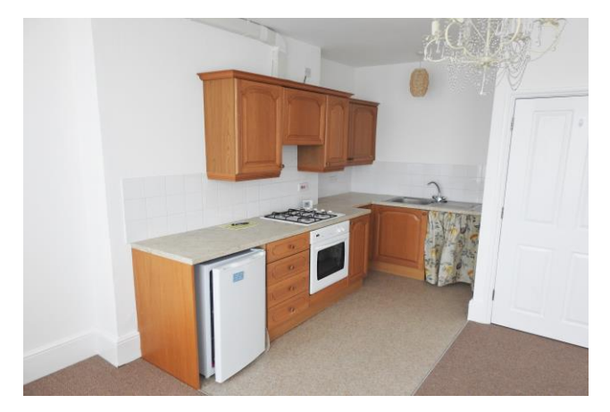
Kirkley Cliff Lowestoft NR33 0BY